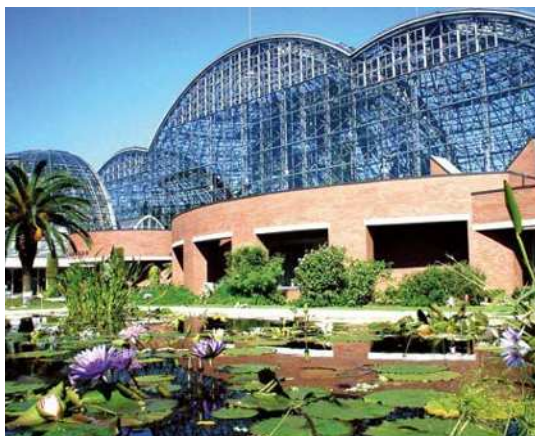
Eye-catching glass domes