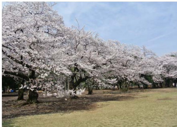
700 someiyoshino and other cherry trees in the park

One can commune with the trees of the park in the breezes of the four seasons. See ginkgos with their yellow leaves, scenery