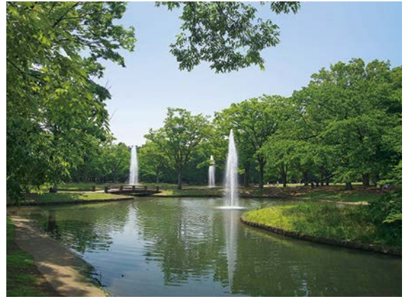
Fountain pond and Central field