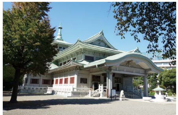
Front of the Tokyo Memorial Hall

This Memorial Hall was built in 1930 to enshrine the remains of about 58,000 victims of the Great Kanto Earthquake. Afterward, some remains of victims from the Great Tokyo Air Raid on March 10th, 1945, were also enshrined. Now about 163,000 remains of the both victims of the earthquake and the war disaster are preserved in this hall.