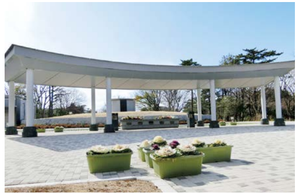
Group Burial Facility

A charnel house was built in 1938 to keep the ashes of the deceased in an urn.