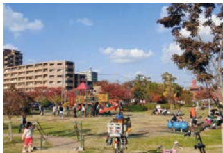
Playground with play equipment

This play area is equipped with a youth baseball field surrounded by net fencing so children can play safely. There is also a playground with slides and swings, which makes this a popular area for children to run around and have fun.