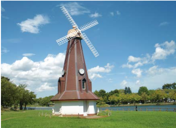
Ukima pond and windmill

This was once part of the main stream of the Arakawa River. Ukimagaiké Pond was formed with a plot left after an embankment was constructed in the early Showa Period. Since 1977, the pond has been open to the public for fishing, free of charge.