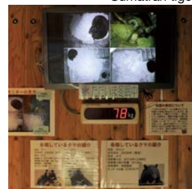
Japanese black bear monitoring

Date of Opening / March 20, 1882, Open Area / 144,048.73 m 2