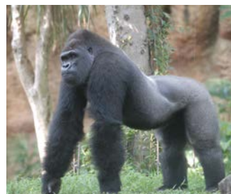
Western Lowland Gorillas

sight as they walk through the woods. At the Elephant Forest, you can see Asian elephants bathing in the dust and water. At the Bear Hill, you can see bears climb trees and play in the water. There is also a hibernation booth for Japanese black bears. The vivarium of amphibians and reptiles in the west section exhibits amphibians, reptiles, and fresh water fish that live in tropical regions and Japan. Along with their surrounding environments such as vegetation and sand, you can compare various aspects of animals resid-