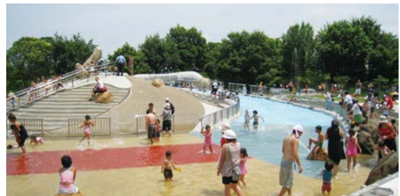
Globe-shape pond (Splashing pond)

At the center of the park, there are fountains in 2 locations connected by the waterway. The small fountain by the park entrance is of a unique style with fan-shaped water coming out of a granite object. A pond with fountain and water slide can also be found on the northeast side. This is frequented by children playing in the water in summertime.