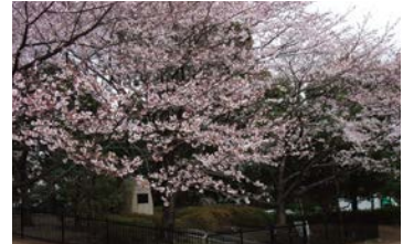
Reagan Cherry Tree (returned someiyoshino)

Originally, Japan presented the ancestor of this cherry tree, known as a goshikizakura (literally, a five colored cherry tree), to the United States in 1912. It was planted along the Potomac River in Washington D.C. by First Lady Helen Taft, wife of the 27th U.S. president, and became known as the "Taft Cherry".