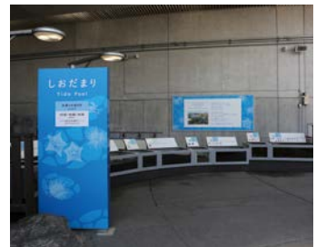
Tide Pool Tank

The tank replicates the environment of shore reefs near the entrance of Tokyo Bay and can artificially create waves and tides. Tide pools form in the shallows during low tide. At the Tide Pool Tank, where visitors can touch creatures of the seashore, we are introducing efficient ways to find sea life and to observe them.