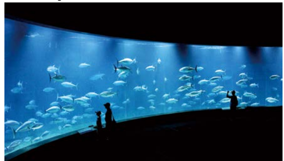
Aqua theater with full view of the large tank

Marine life from a wide area from the subtropical Ogasawara islands, through the Izu Islands, to the tideland of Tokyo Bay are on exhibit. Visitors can observe the fish from the top of the tank or watch aquarium keepers at work in the bright indoor room lit with natural sunlight.