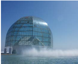
Roof top glass dome

The main aquarium is a round building with a diameter of 100 meters. Its entrance is on the roof, inside a 21-meter high glass dome. The surface of the fountain pond around the dome looks like it is connected to the Tokyo Bay so that visitors can enjoy a grand-scale view.