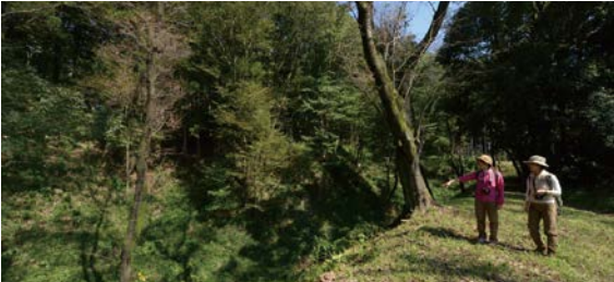
Takiyama Park Ruins

According to recent research, Hojo Ujiteru supposedly built this castle