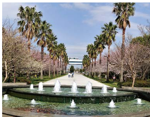
Water and greenery promenade

California fan palms and cascades along the south section main park path linking the south central entrance with the fountain plaza create an exotic feel.