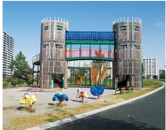
Mixed playground equipment

The park is a safe space with various fields such as observatory field, interactive field, picnic field, and multipurpose field, sports facilities such as tennis courts, outdoor stage, fountain, sundial, and various playground equipment. Also, an area of about 1 km where the park and Sumidagawa River meets, forms a super-levee, creating an open urban space with a great view, water friendly, and rich in green.