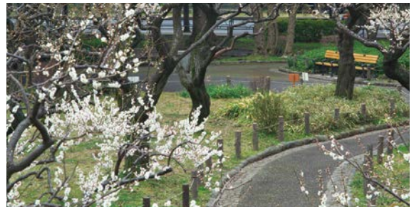
Plums in Ginsekai

This artificial valley was restored in 1984. The combination of large and small natural rocks surrounded by trees is reminiscent of deep mountains and dark valleys. The waterfall tumbling from a 10-meter high rock formation is spectacular. As the name implies, the valley is surrounded by maple trees. The colorful leaves in autumn make the sight even more amazing. Near the bridge at the middle of the stream stands a 20-meter tall Japanese zelkova that is 250 centimeters in circumference.