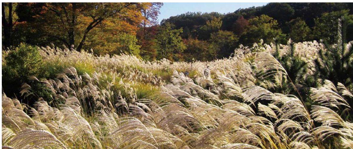
Japanese pampas grass field

Opened / April 29, 1937 Area / 234,915.33 m 2