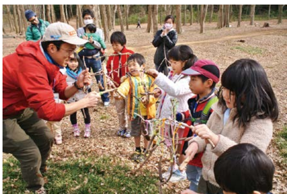
Sayama Kids Program

“Sayama Kids program” is held on the first Sunday of the month, and children from five to elementary school age are able to explore the park with the park ranger. “Guided Walk” that the park ranger introduces nature in the park is held on the third Sunday of the month. Both events start from 1:30 pm and take about hour and half long. Please inquire the park center for details.