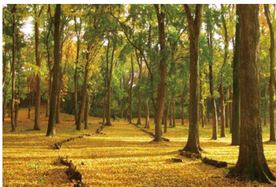
Golden leaves of the trident maple forest