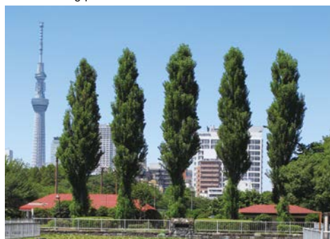
Miniature lumber pond reproducing the timber yard

The rocks used on the banks of the miniature lumber pond were once weights. Logs were sunk with those to preserve the wood for long periods of time.