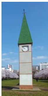
The symbol of the park: a point-ed-cap clock tower

The central field is defined by its point-ed-cap clock tower. Playground equipment such as an obstacle course is featured in the adventure field. You can also enjoy cherry blossoms during spring and ginkgo during autumn at the semicircular grass field.