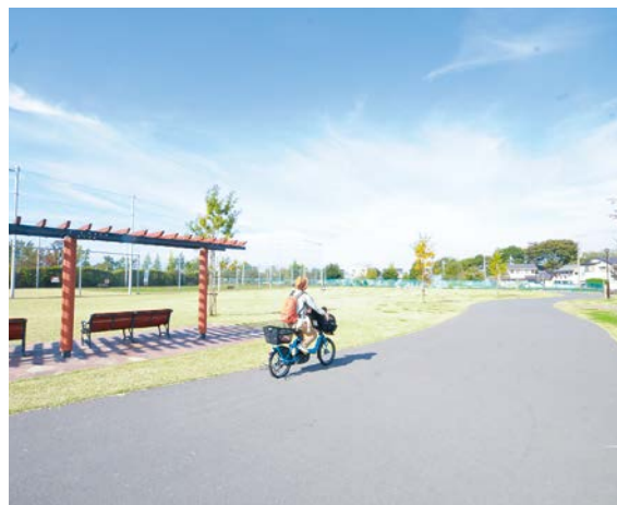
Katarai (chit chat) Plaza

Rainwater in the park is all returned to the ground through seepage trenches and wells, helping feed the Minamisawa spring.