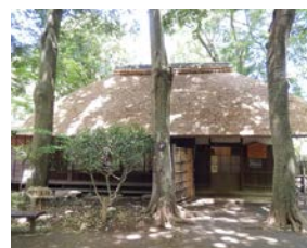
Tokutomi Roka's House Main Quarter

His building was constructed in 1959 to hold heirlooms donated along with Roka's house. They include daily items, his works, documents, letters, and farming equipment. Exhibitions of those items are open to the public and regularly rotated. (Open 9 am to 4 pm. Admission free.)