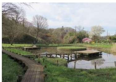
Okubo park annex dragonfly pond

This part of the park has a dragonfly pond and Japanese pampas grass field; and agricultural fields and farm-houses dotting the slope can be seen from the ridge. Yamanohata bus stop is about a ten-minute walk to the southwest of the pond.