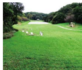
Playground Equipment & Exercise Square