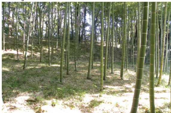
Oyamada Park Bamboo Forest

In the park surroundings, too, the pastoral landscape all around creates an atmosphere befitting the Tama hills. That makes the park great for hiking and other excursions.