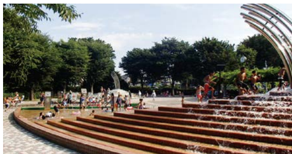
Water square in the summer (rainbow pond)

The water square is just inside the park's west entrance, presenting an image that fits the Oizumi name. A large fountain and monument in the square present visitors with a refreshing image.