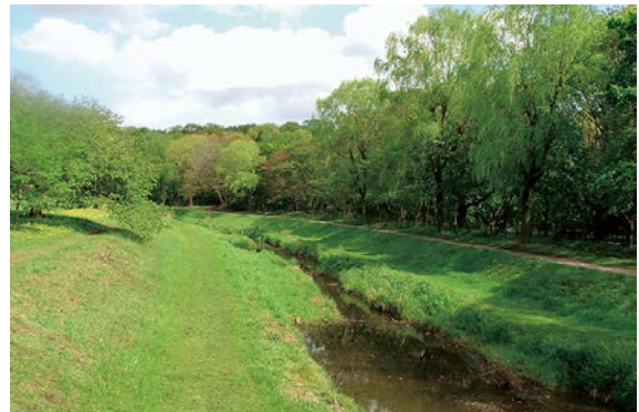
Nogawa river during the season of fresh green leaves

A 10-meter-wide gently curving river flows slowly through the park.