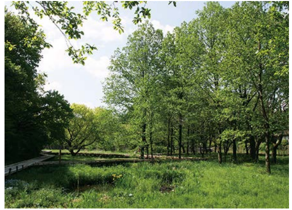
Nature observation garden in early summer

The center is open every day from 9:30 am to 4:30 pm except Mondays.(following day if Monday is a holiday) Closed from December 29 to January 3.