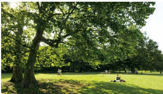
Great lawn offers a relaxing time

The grass fields that were once a golf course are shaded by mixed woods of trees such as sawtooth oak and konara oak and groves of cercidiphyllum japonicum, trident maple, camphors, Japanese zelkovas, and others. The fields are separated into areas with names such as rest field, children's field, great lawn, and free field. They are used for picnics, resting, and other activities. Of the various fields, the children's