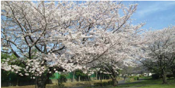
Someiyoshino (cherry) in full bloom