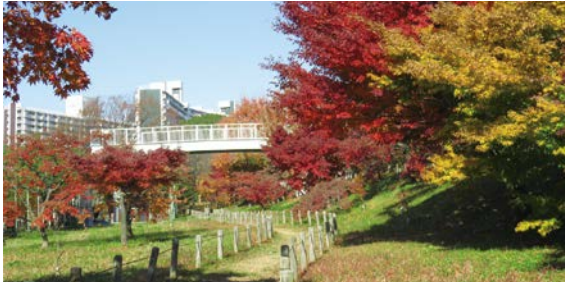
A District Momiji (Japanese Maple) Zone

Nakagawa Park is sandwiched between Nakagawa River flowing in eastern Tokyo and Loop Road No. 7, and divided into Section A and B. Climb the stairway at the park entrance of the Loop Road No. 7 side in Section A and you hear the sound of flowing water. The reason for that is that the park is built on the roof of a wastewater processing plant.