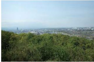
View from the observation platform

A streamside park path leads to Naganuma Station on the Keio Line, connecting the base of the hill with the ridgeline. The stream view is full of variation, being sometimes a wide val-