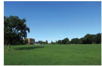
Large grassy field

Bunkers remain in the park today as relics of war. These were fortified hangers to protect aircraft from enemy bombardment. About 30 were constructed around Chofu Airfield. Two are situated in the park.