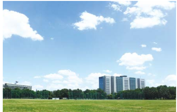
Harappa Hiroba Square

There are woods of Musashino (konara oak, sawtooth, oak, acacia, Japanese zelkova, etc.) around the park.