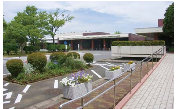
Farewell Hall and Crematory furnace

The reception desk takes calls at night in order to accommodate the needs of users.