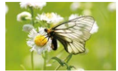
Japanese Clouded Apollo comes in spring

This is a perfect spot to see the transition of the forest as sections has gone through planned stump sprout regeneration (refer to page 89) care. A rich variety of underbush grows in the forest floor, streams and ponds at the center, and open grass fields provide various environments for insects like butterflies and beetles and you can also observe of 70 species of wild birds including pheasants, Japanese pygmy woodpeckers, long-tailed tits, and varied tits.