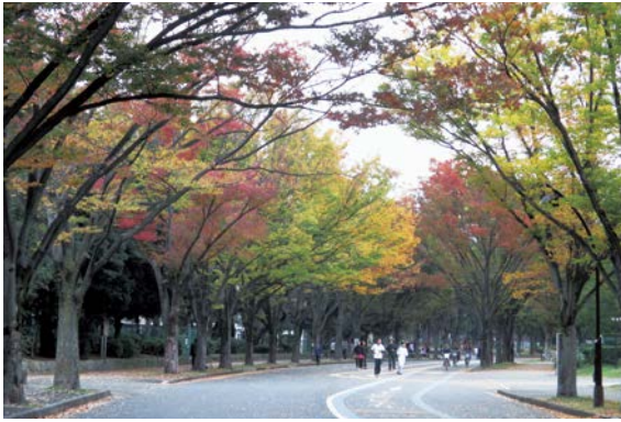
Zelkova trees in autumn foliage