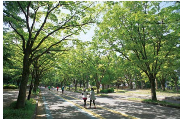
Zelkova trees during early summer