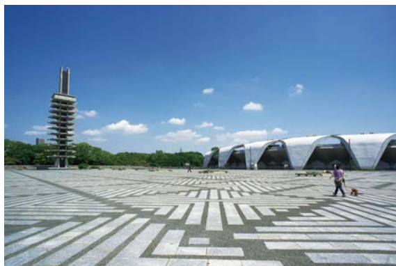
Olympic memorial tower and central plaza

Even with all the concrete sports facilities across the park, this place doesn't present a cold atmosphere. Broad expanses of greenery work to soften the atmosphere.