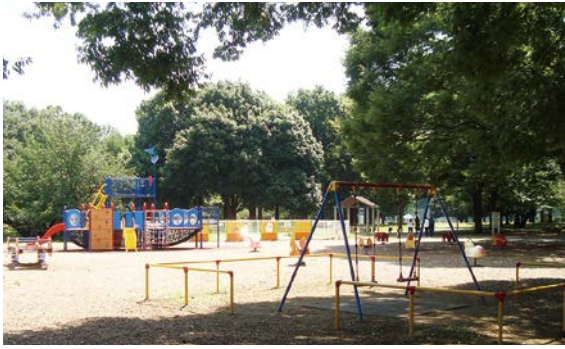
Athletics Hiroba Square