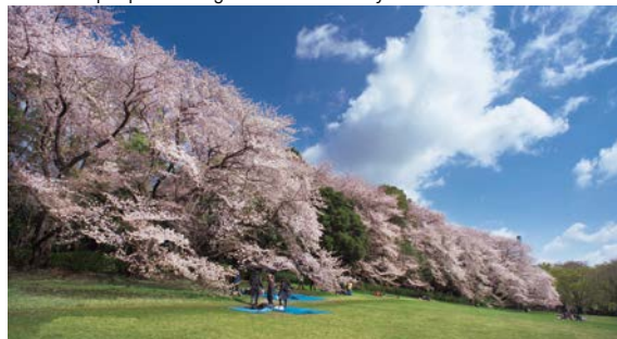
Cherry blossoms in bloom at Family park

Cherry blossom trees are planted everywhere in the park, and the family park holds the most trees. but many of those are concentrated in the family park and Yatogawa River areas. In springtime, the park is alive with people coming to view the cherry blossoms.