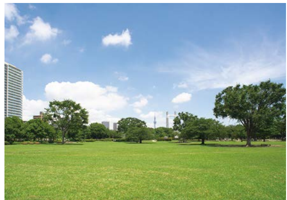
Fureai Hiroba Square

This bridge in the center of Kiba Park is the symbol for the park. Its fine and dynamic structure blends in beautifully with the surrounding environment. The 250-meter long bridge with main column standing 60 meters high includes the latest engineering technology such as measures to prevent collapse of a bridge.