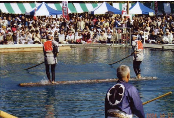
Floating log riding on the event pond

The wide field in the south section is used for a variety of purposes. Families have picnics and relax there, and small groups play sports, and others just sit and talk. There is also a barbecue field at the north end