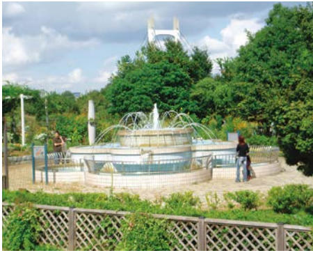
Fountain at the urban greening botanical garden