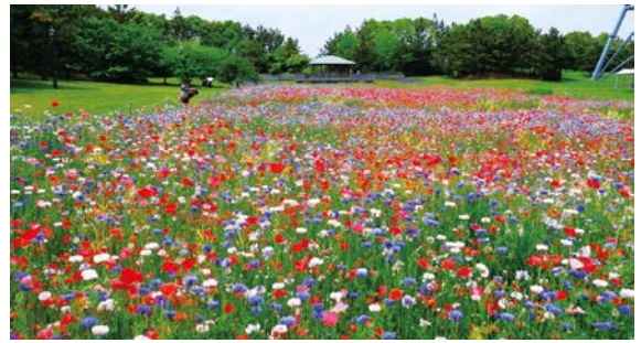
Poppies (From mid-May to early June.)