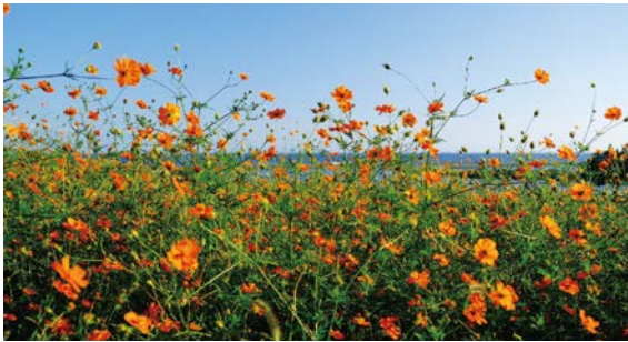
Orange cosmos (From late August to early October.)