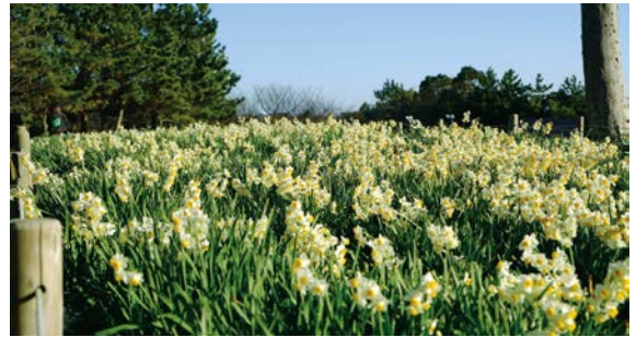
Narcissus (end of December through February)

in the city provides a home for a variety of creatures.