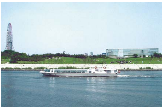
Giant Ferris wheel, marine bus, Tokyo Mizube Cruising Line, and observation restaurant Crystal Review viewed from the west beach

The bird watching center that forms the main facility here has an information corner where you can see videos and exhibits about birds. There are also two ponds, an observation building, observation window, and other facilities to view birds in nature. This oasis