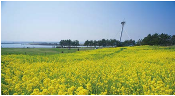
Rape blossoms (From early March to early April.)