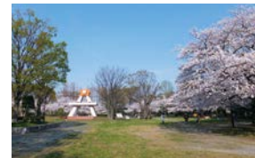
Area A with clock tower