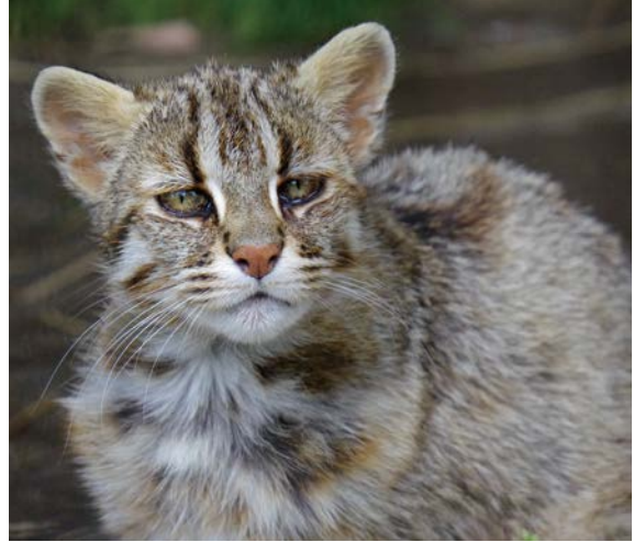
Tsushima leopard cat

In addition to the animals of Japan, there are also friendly animals for children visiting the zoo for the first time. At the guinea pig petting corner, you can feel the warmth and movement of living beings by petting the guinea pigs. The Duck's Lunch event is held every first and fourth Sunday, and you can experience feeding the ducks. You can also meet popular foreign animals such as the capybara, Fennec fox, and Humboldt penguin.