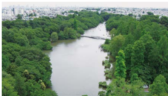
Full view of Inokashira Pond

The landscape is full of variety with Inokashira Pond in the lowland, and Gotenyama on the highland.