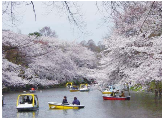
Cherry trees lining the pond