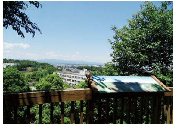
View from the observation deck