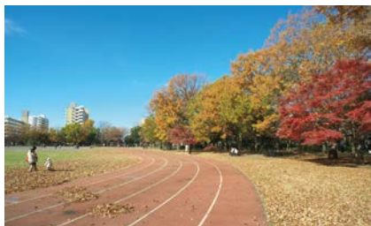
Yellow leaves in the athletic field