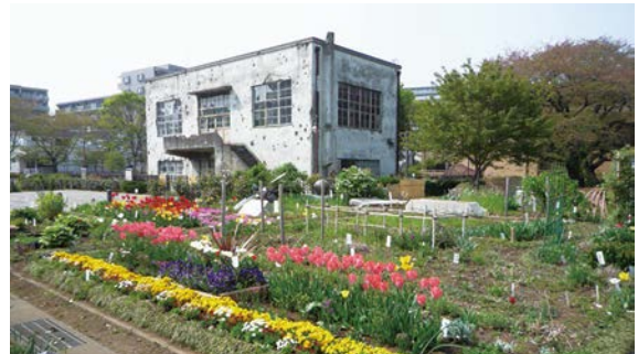
Tulips and former substation

In addition to a fee-based tennis court and baseball field, There are fee-based tennis courts and baseball field, multipurpose exercise field to be usable in gate ball, running and so on. The Higashiyamato city gymnasium and swimming pool are also in the park.