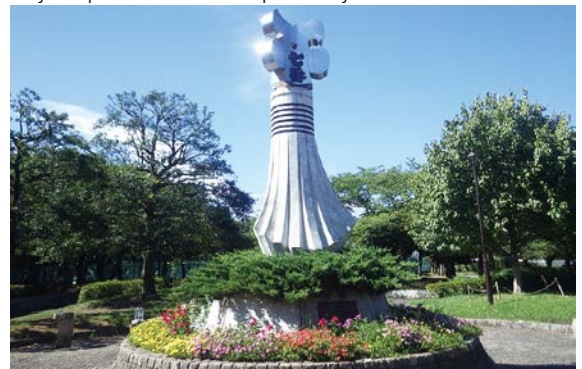
The Symbol of this Park: MATOI

As a countermeasure against such damage, the Tokyo Metropolitan Government is going forward with regional redevelopment and a plan to establish disaster prevention bases. Higashi-Shirahige Park is the first of such bases. A statue of a matoi flag used by old Edo fire brigades