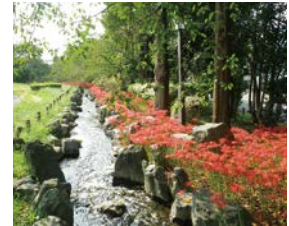
Red spider lily