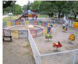
Playground equipments for infants at Wakuwaku field

Higashi Ayase Park is in an inverted “U” shape with a walking path connecting the lots dotting the area from Ayase Station, where Chiyoda and Joban Lines cross. There used to be rice paddies here, but through a land readjustment project, it was turned into a park. The park stretches about two kilometers long. Along the walking path on the west side of the park flows a stream that forms the source of Hanahata River that makes use of what was once irrigation water. Exercise playground equipment and a gateball court are also located there. A variety of exercise facilities are located at the north side, surrounded by greenery. As a sports oriented park, the park is equipped with a baseball field, tennis court, martial arts hall, heated pool, as well as other facilities. It is gaining much attention as a park for people of all ages to enjoy.