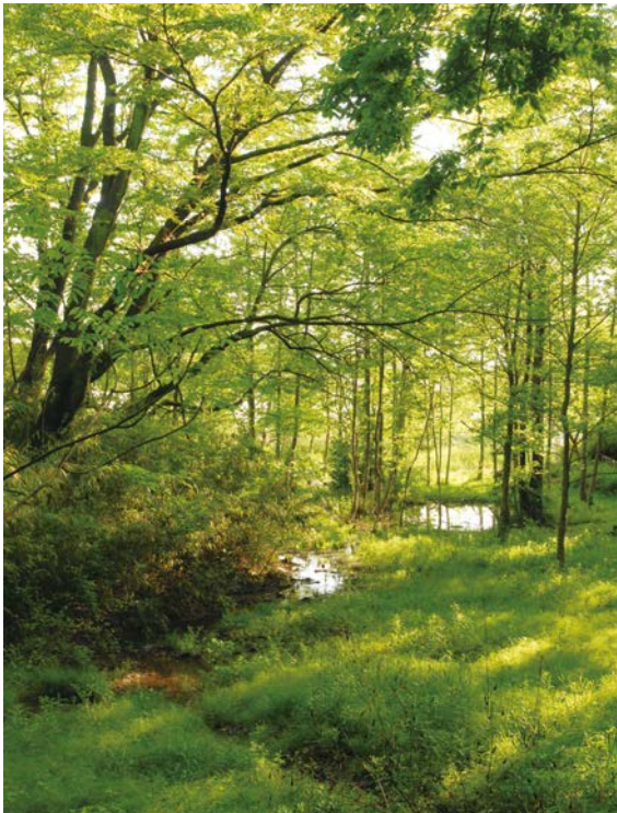
Futatsu pond area

The ridge road, spanning 1.9-kilometers across prefectural borders, is easy to walk with moderate ups and downs. Hikers can enjoy the flowers of the Clethraceae family and yamazakura cherry as they walk. South from the ridge road are numerous paths that lead to well-lit openings in the quiet of the forest, perfect for a light picnic. Also worth noting is the birdwatching area around the Futatsu ponds in the south part of the park.