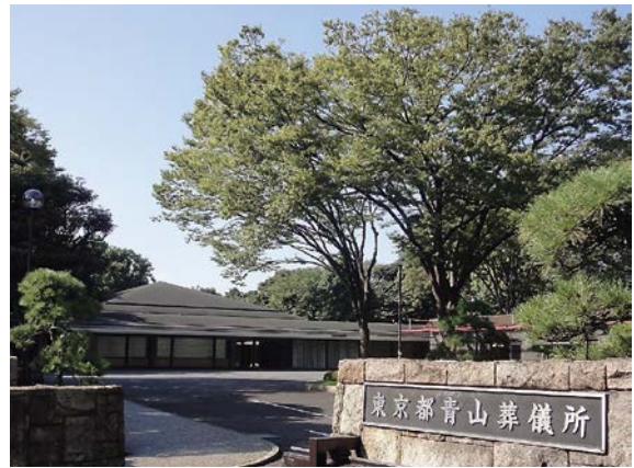
the front gate

Recently, people such as elementary school teachers and people who contributed locally are having funeral services here.