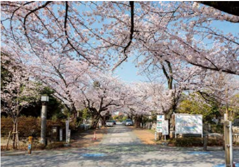
Row of cherry trees in the cemetery (Ward road)

Also, there are graves of famous people including politicians, military people, and culturally important people of Meiji and Taisho periods. Among them is the grave of Toshimichi Okubo (politician from Meiji Revolution) which is designated as a Cultural Heritage of Tokyo.